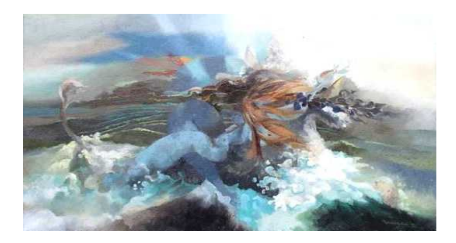
Untitled – Glyn Morgan

Glyn Morgan aspired not just to surface realism, but an inner reality, revealing life, all growing things. Stating that "the primary purpose of art is to uplift the human spirit". An exhibition featuring the work of Glyn Morgan will be staged during the Norfolk & Norwich Festival and Open Studios.