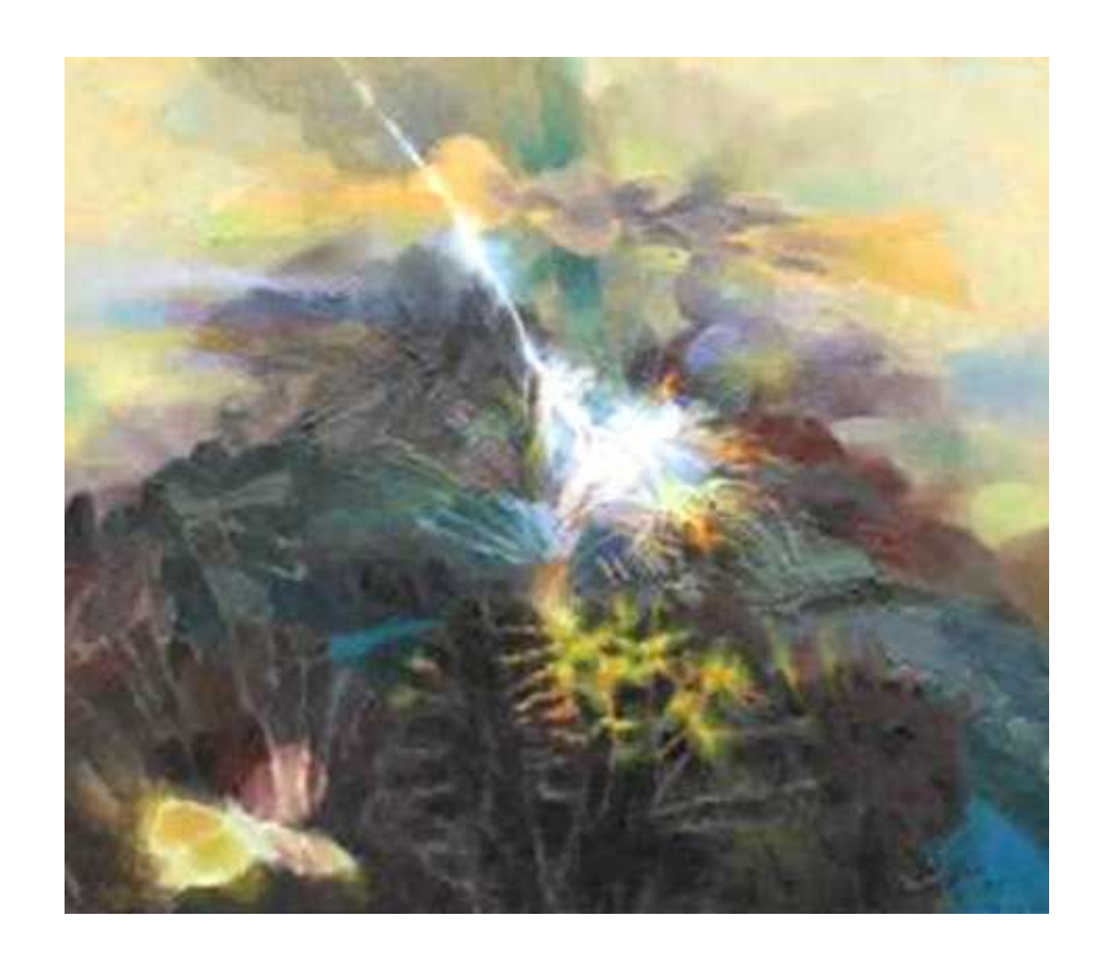
Landscape with Moths at Dusk - Glyn Morgan